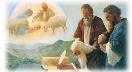
An artist's perception of Isaiah writing the prophecy of Christ's birth.

In Isaiah 7:14 we are told that the Lord would give a sign and that this Savior would be born of a virgin and he would